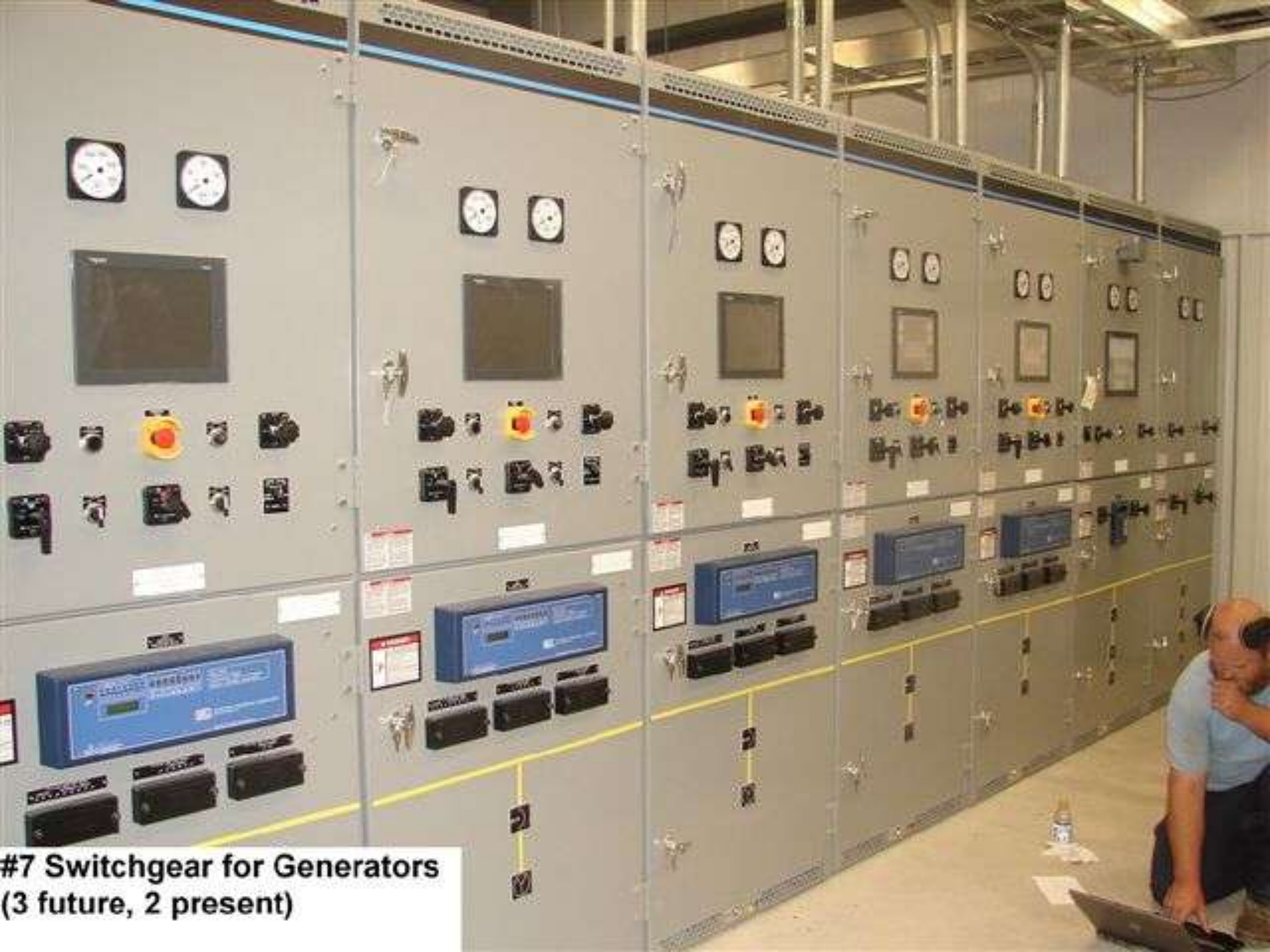
#7 Switchgear for Generators (3 future, 2 present)