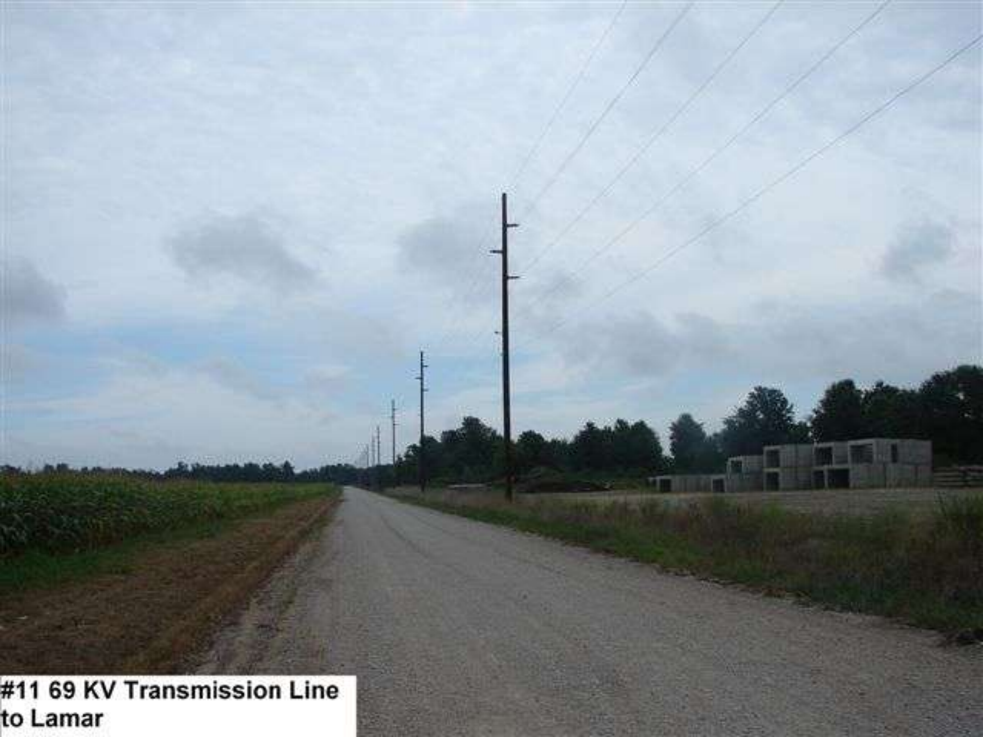
#11 69 KV Transmission Line to Lamar