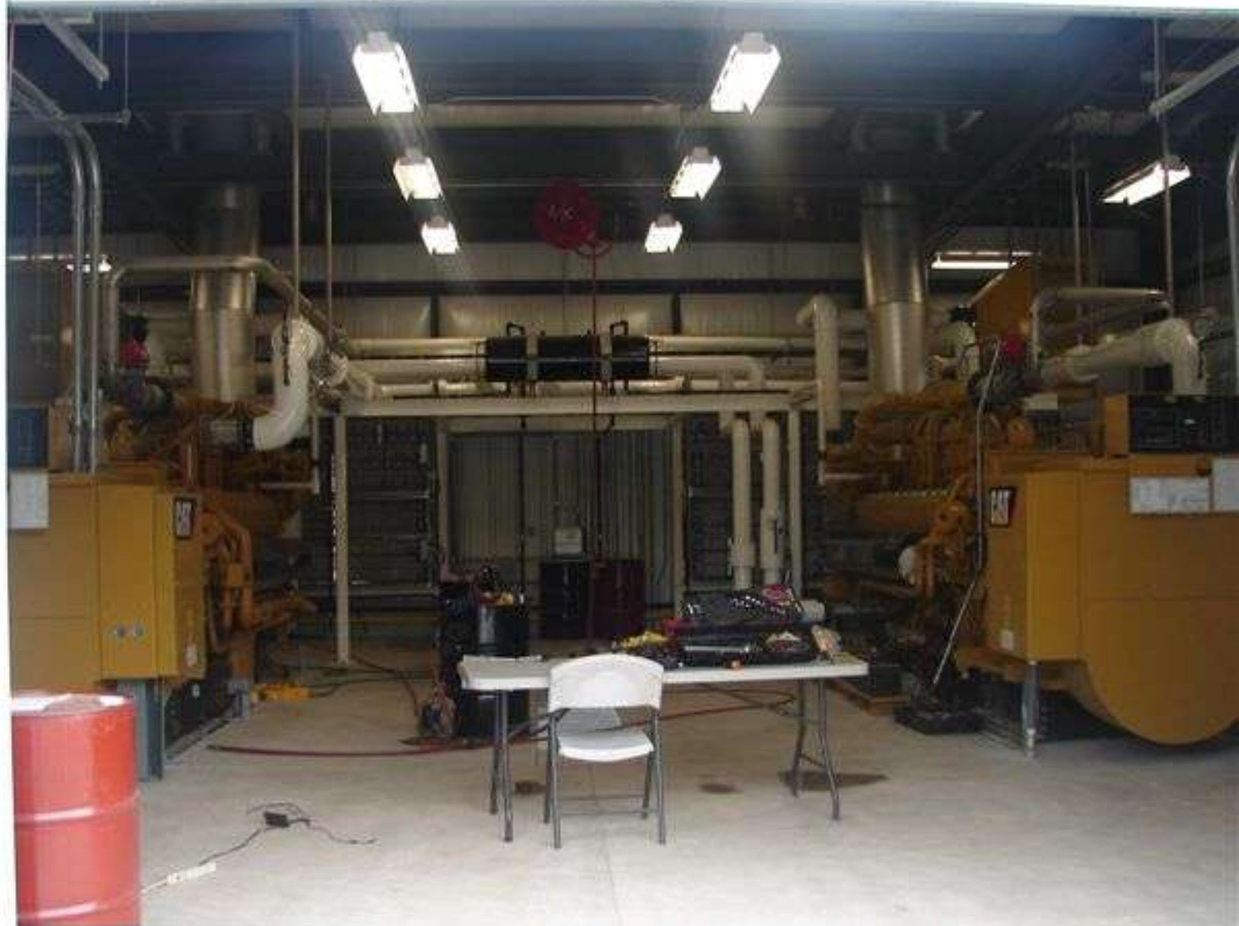
#6 Both Engines w/Piping