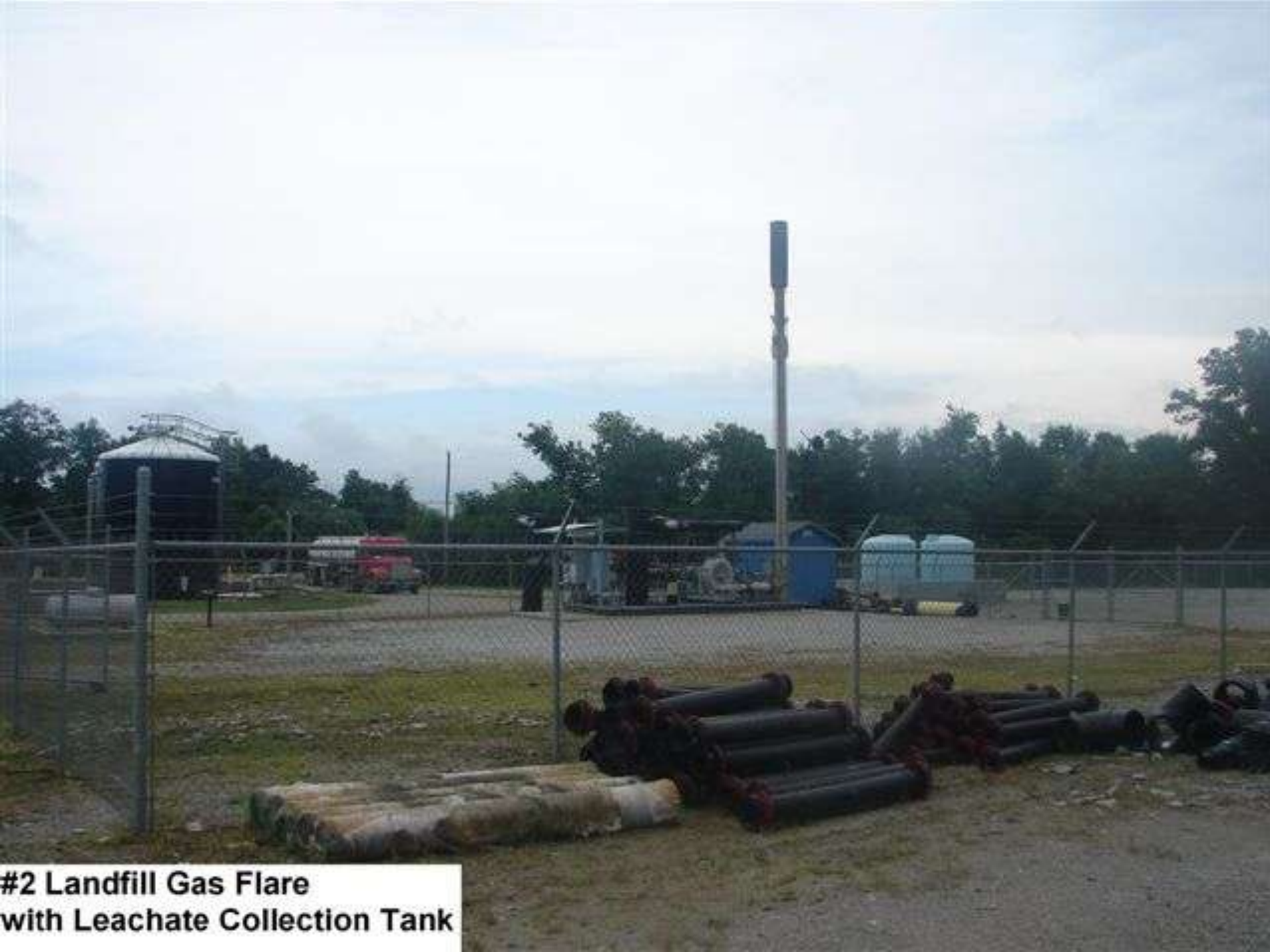
#2 Landfill Gas Flare with Leachate Collection Tank