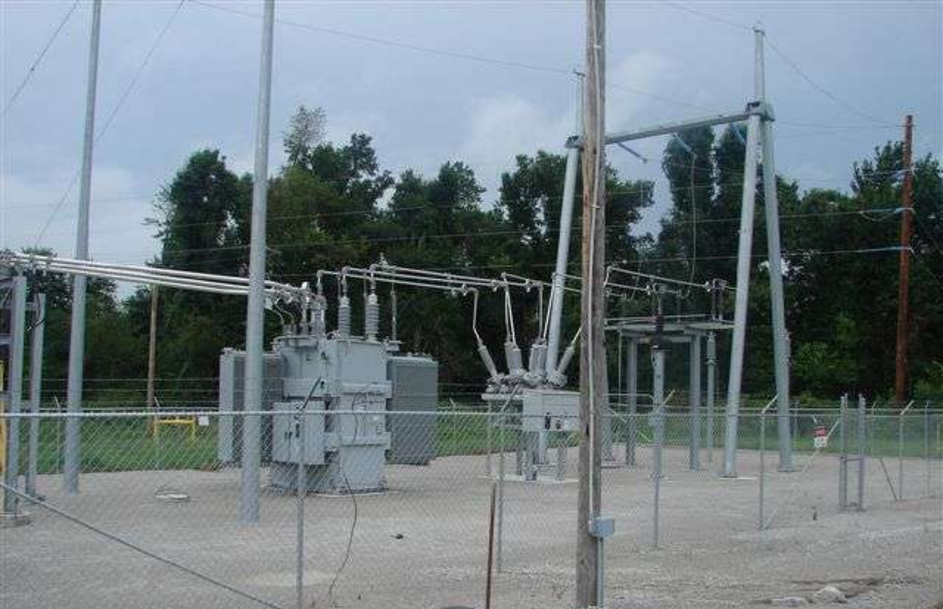
#10 Substation converting 480V to 69KV to wheel back to Lamar