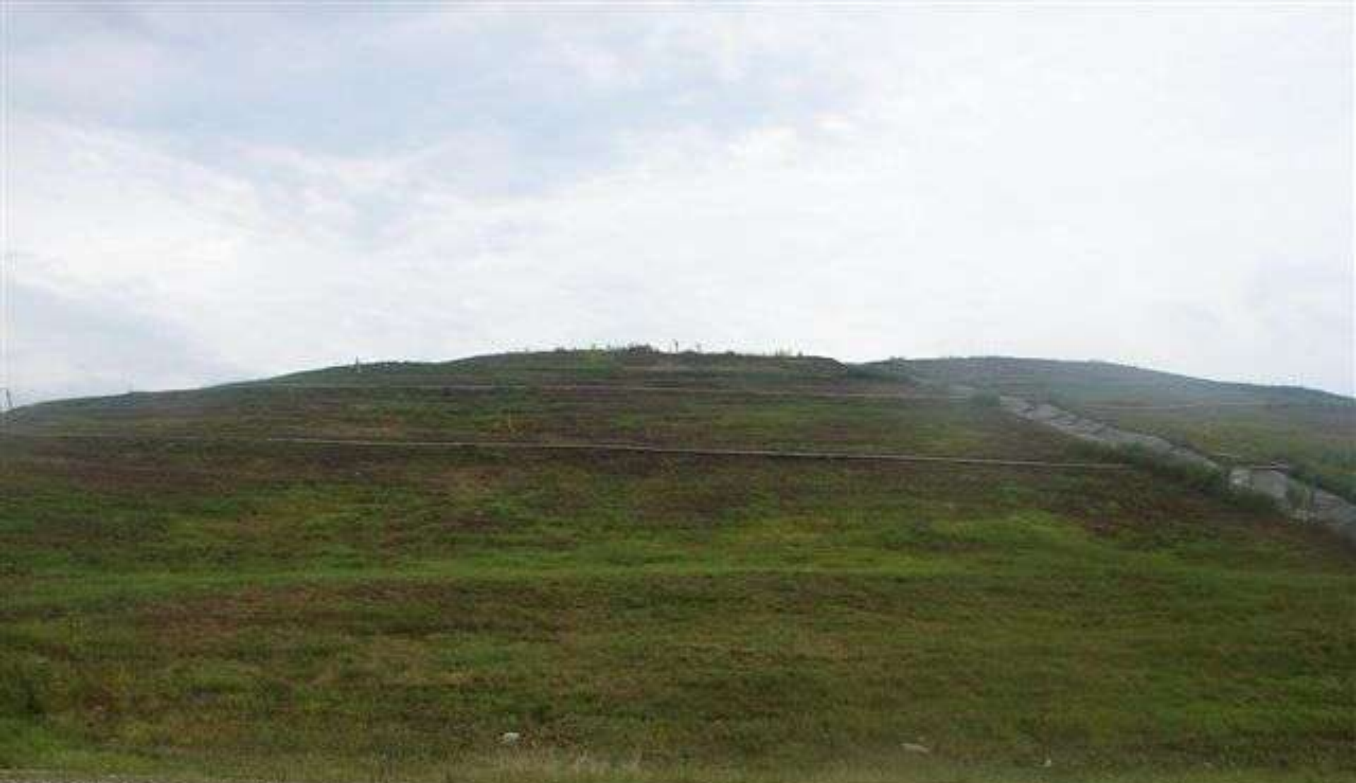
#1 Allied / Republic Landfill Cell & Wells