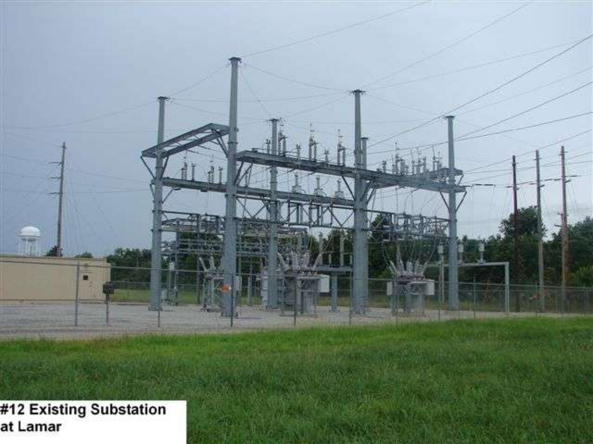
#12 Existing Substation at Lamar