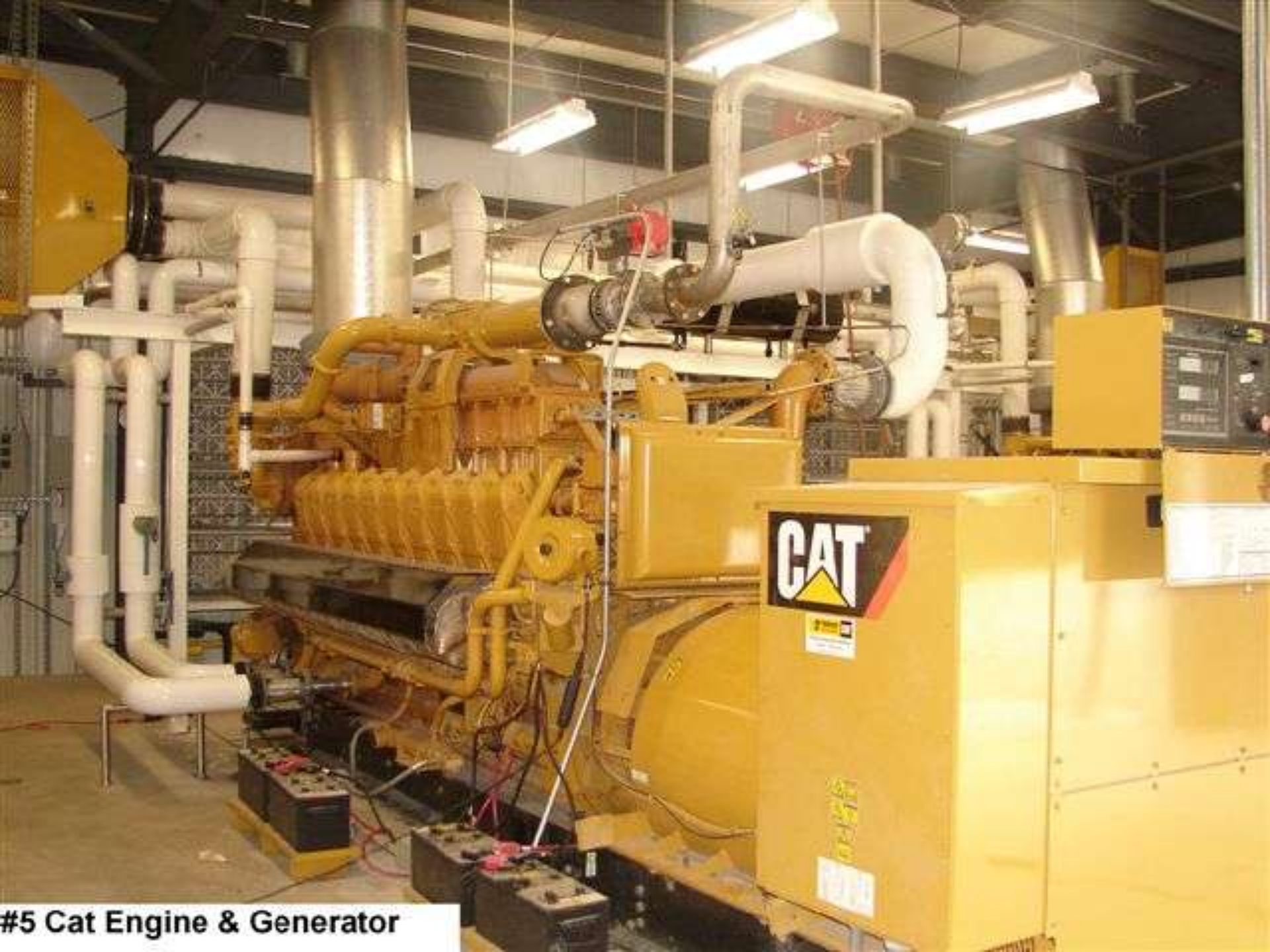
#5 Cat Engine & Generator