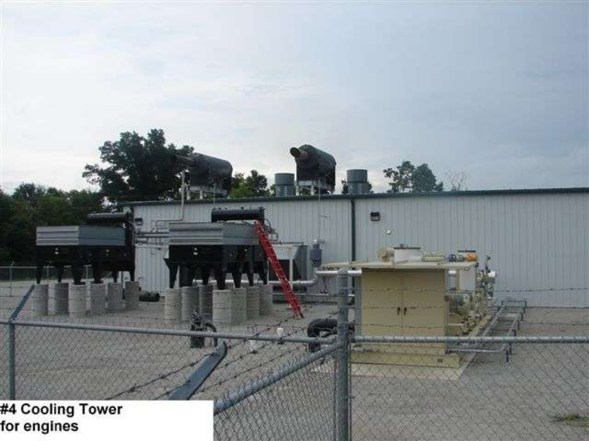
#4 Cooling Tower for engines