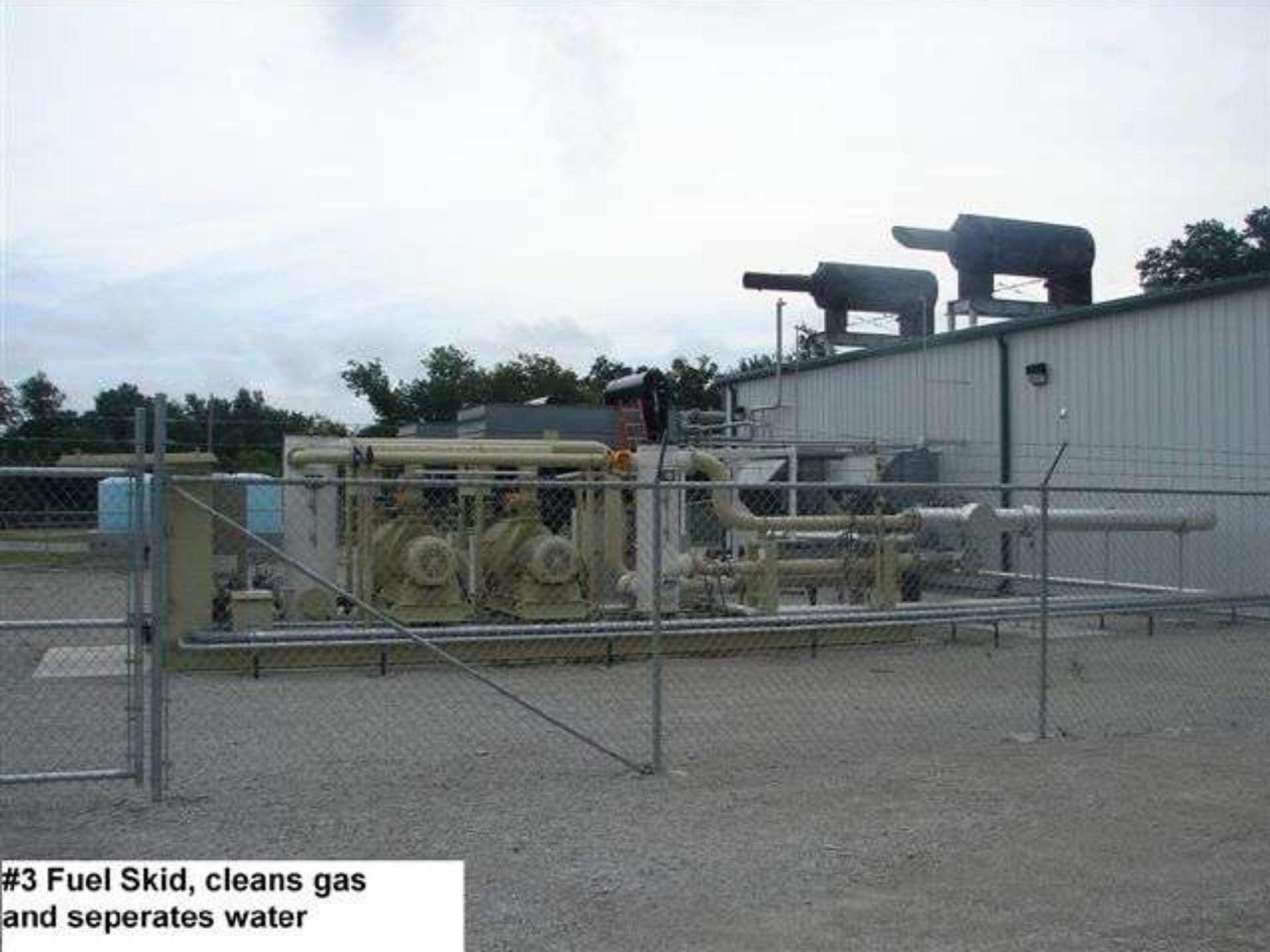
#3 Fuel Skid, cleans gas and seperates water