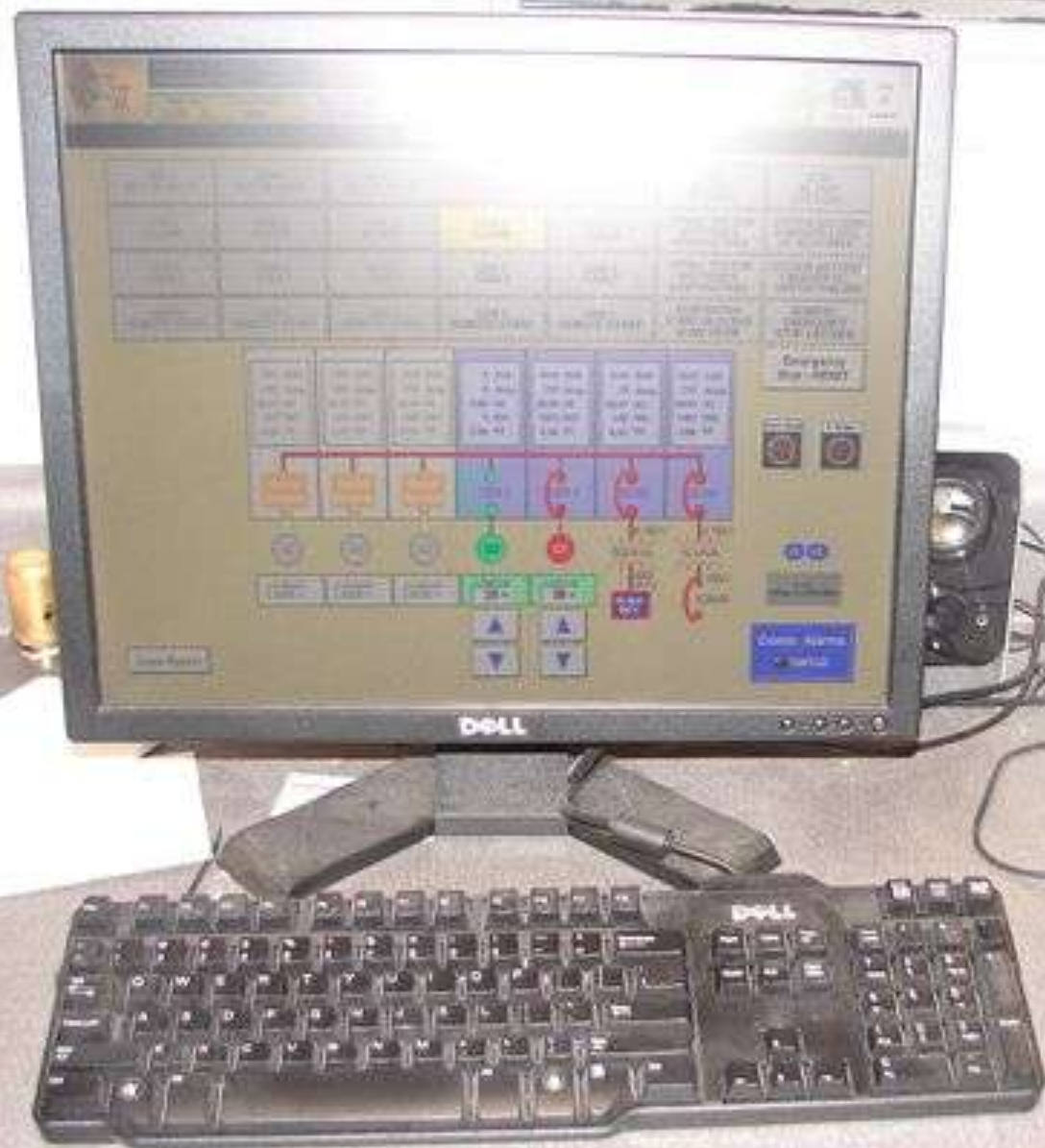
#9 Computer Screen showing all activities at LFG station