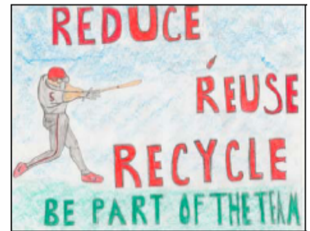
6th - HM, Colin Cain Canton V-V Canton MO