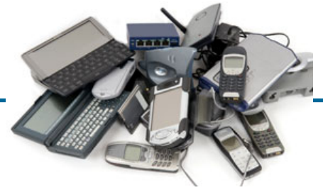
Image from Resource Recycling information on e-scrap conference, September 2008.

On June 16, 2008, acting Lt. Governor Peter Kinder signed into law Senate Bill 720, also known as the "Manufacturer Responsibility and Consumer Convenience Equipment Collection and Recovery Act." The law requires computer manufacturers who sell their products in Missouri to implement a recovery plan that specifies how their computers and computer accessories will be collected and recycled or reused. Manufacturers must also label their equipment to identify themselves as the manufacturer. Retailers are prohibited from selling new computers in Missouri unless the equipment contains a manufacturer's label and the manufacturer is listed by the department as having a recovery plan. The main point of the law was to enable a consumer to conveniently recycle equipment without paying a fee at the time of recycling.