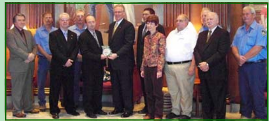
The 2009 agency winner – Northeast Correctional Center (Bowling Green).