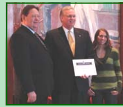
University of Missouri, Columbia