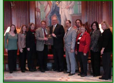
MORA Board members with Governor Nixon

On November 18 several MORA board members, many Missouri RecycleMania college and university participants and recycling award winners from state government met in the Capital Building to participate in the Missouri/America Recycles Day Proclamation Ceremony with Governor Nixon. Each group was given a private visit with the Governor, pictures were taken and MORA held a reception to honor the winners in a hearing room at the capital following the ceremony.