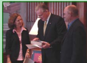
Truman State University