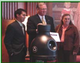
Missouri Central University